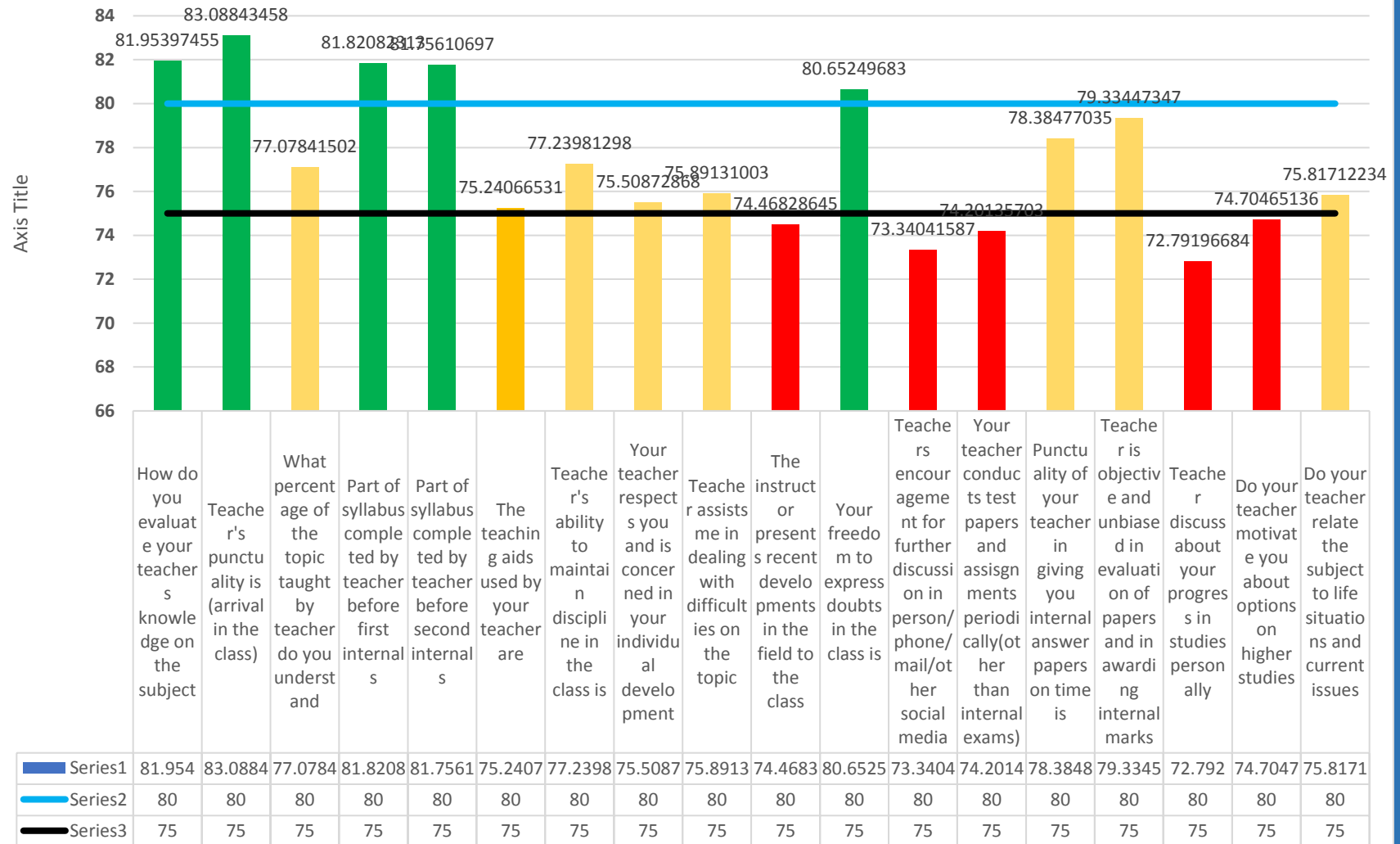
Students evaluation on teachers (2018-19)

Students Satisfaction on teaching & learning