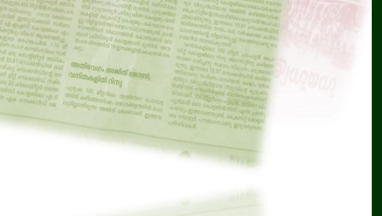
കോളേജിലെ 100 മീറ്റർ ഓട്ടം