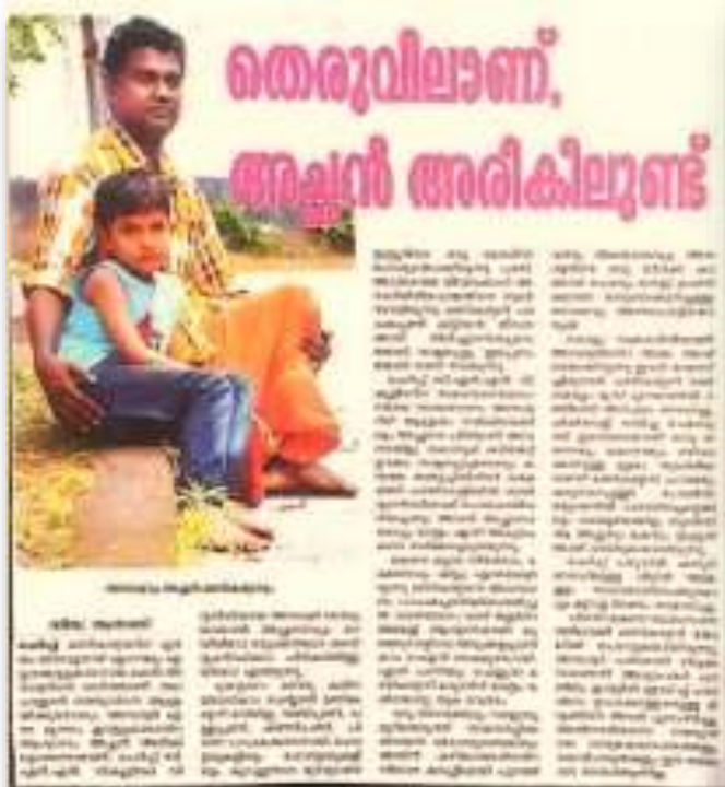
Mathrubhumi (Thrissur Edition) report, Dated: 04/08/2011