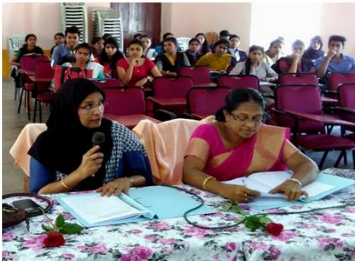
Judges for the competition