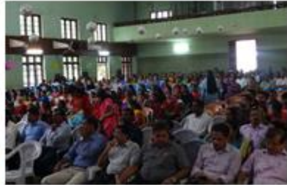
View of Audience