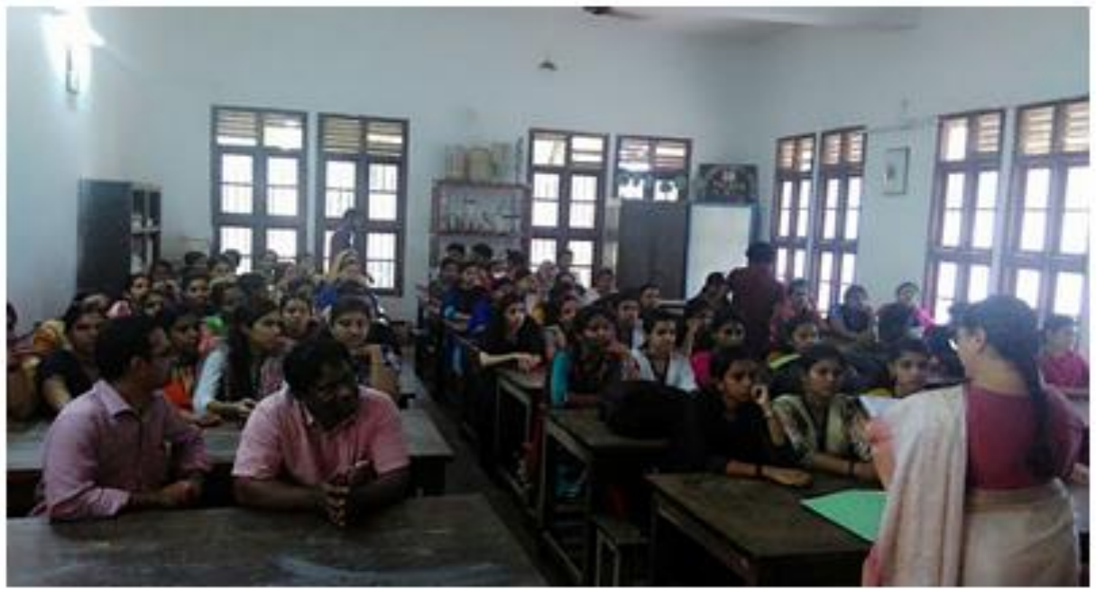
Biodiversity Club – A view of General Body Meeting