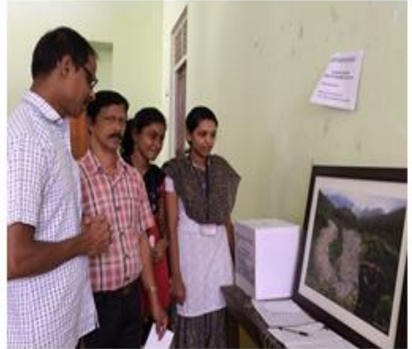
CAPTION CONTEST Conducted on 7 th June 2016 In Connection with World Environment Day 2016