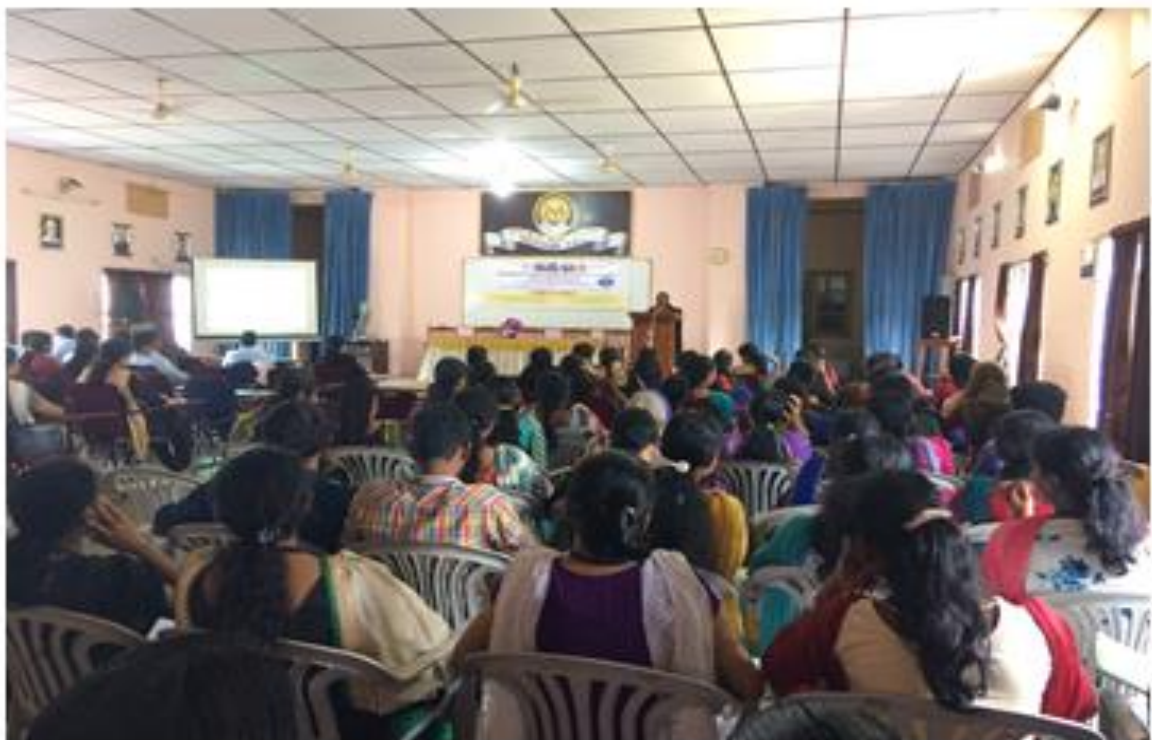
Audience attending Invited Talk on "Nutritional Benefits of Pulses" Invited Talk on Nutritional Benefits of Pulses