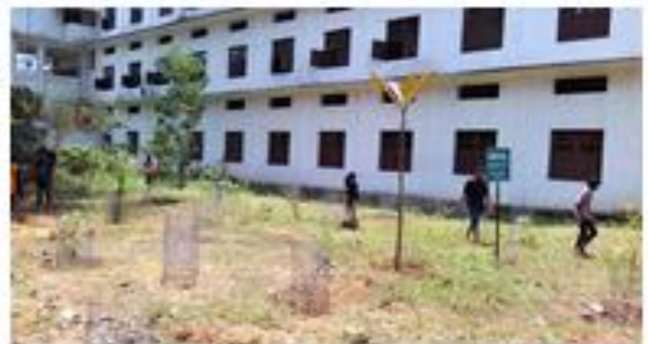
Biodiversity Club members at Shanthistal