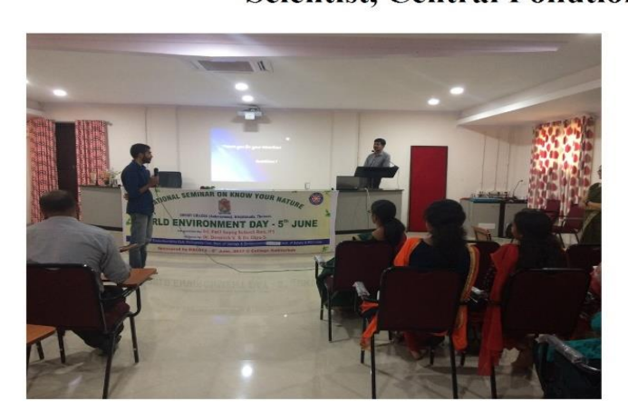
Interactions of participants with Resource person