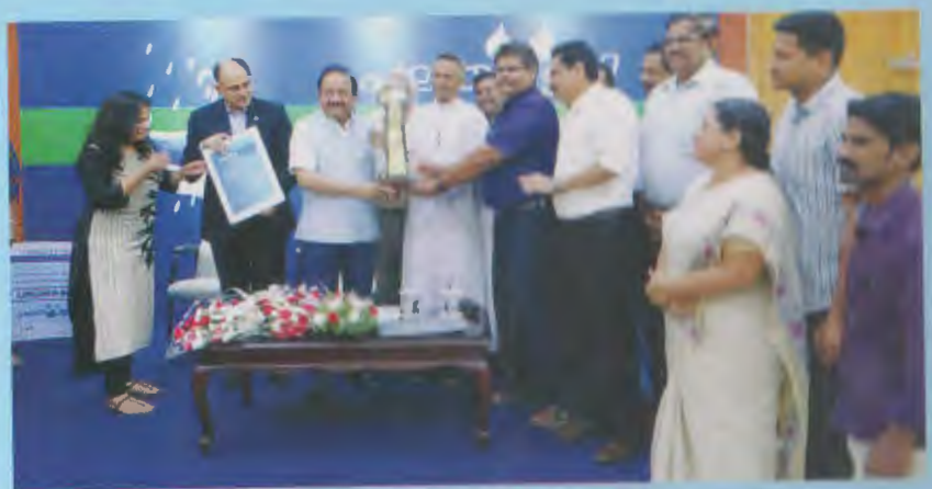
Christ College (Autonomous) Irinjalakuda has won the 'Palathully Peruvellam' Award 2015, instituted by Malayala Manorama