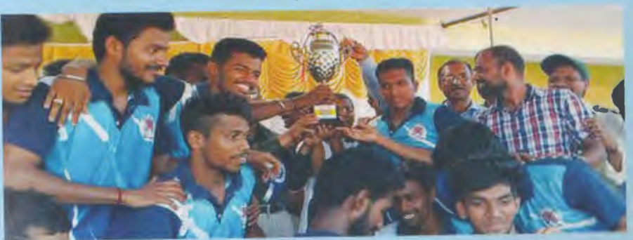
Christ College (Autonomous) Irinjalakuda has won the Calicut University Overall Champianship in Athletics meet, 2015