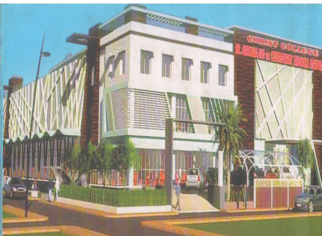
Proposed Padmabhooshan Fr. Gabriel Birth Centenary Indoor Stadium