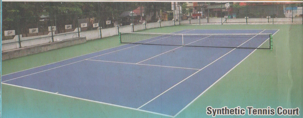
Synthetic Tennis Court