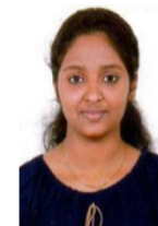
Christ College, Irinjalakuda