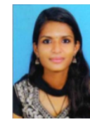
Christ College, Irinjalakuda