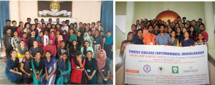
Participants of the programme