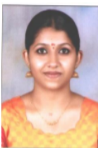
Christ College, Irinjalakuda