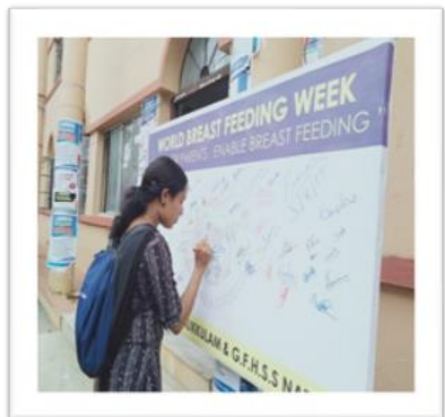
Signature campaign at Panchayath Office