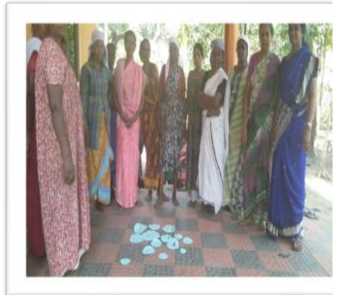
Participatory rural appraisal using Venn diagram