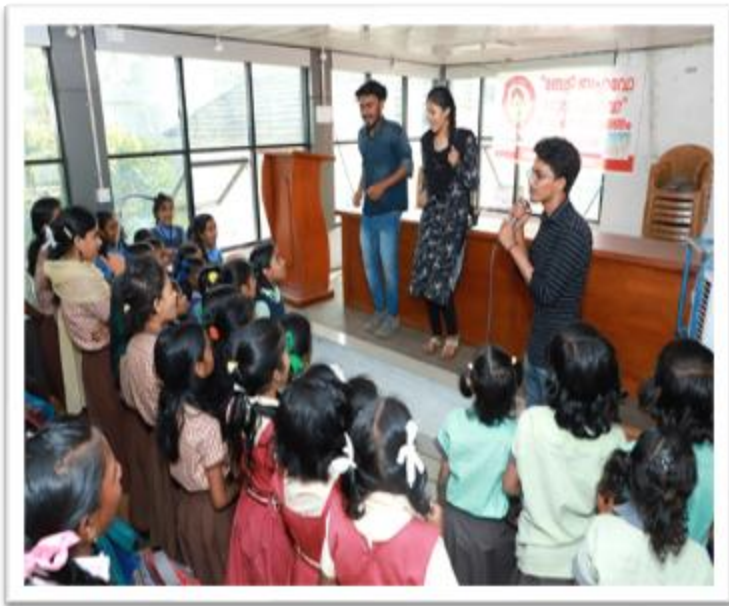
Group activity for girls

Bedi PadavoBetti Bachavo: National girl child day- Social work trainees assisted the ICDS supervisor in the special meeting of girls for share their needs and problems for their own development. Trainees made an interaction session and identified their problems and needs through a group activity on 24th January 2020.