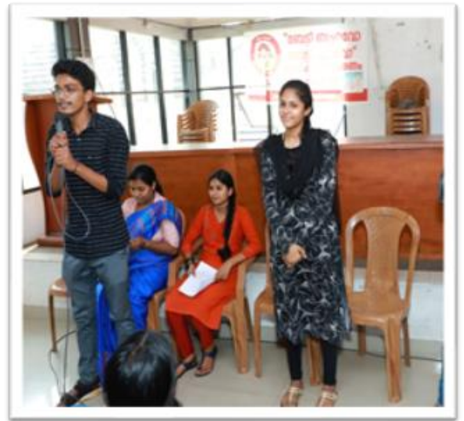
Concluding session -Group activity for girls