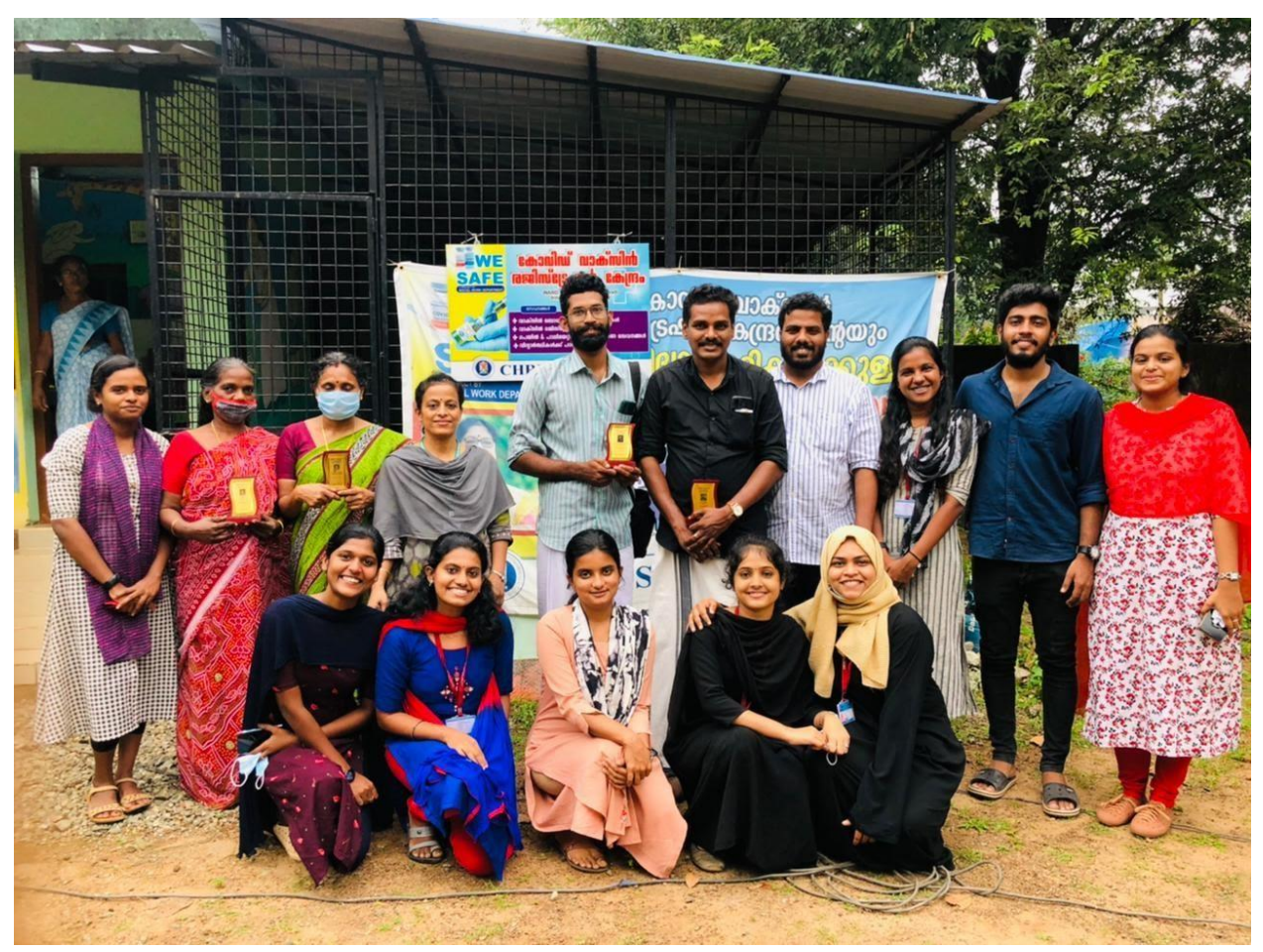
Programmes implemented under We-Safe project: