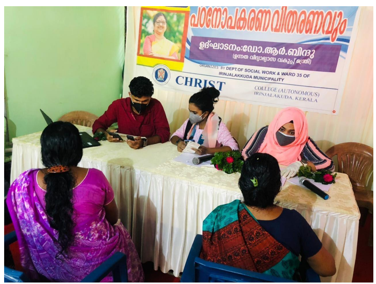
Volunteers helping people to register for vaccination :