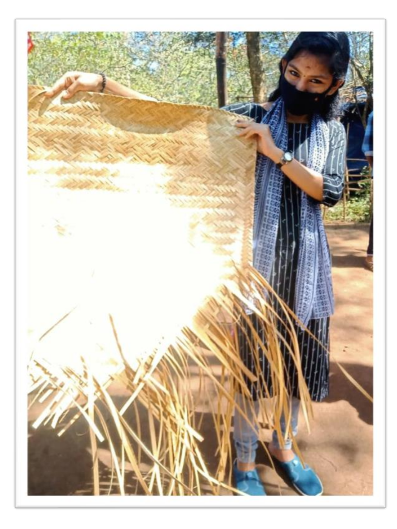
Students with handicrafts made by tribal people