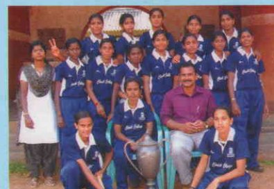
VICTORIOUS HOCKEY TEAM