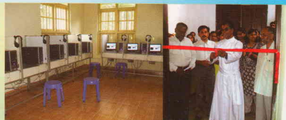
Inauguration of Digital Multimedia Language Lab