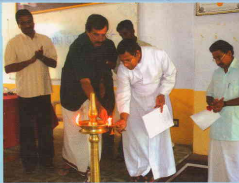
TOURISM CLUB INAUGURATION