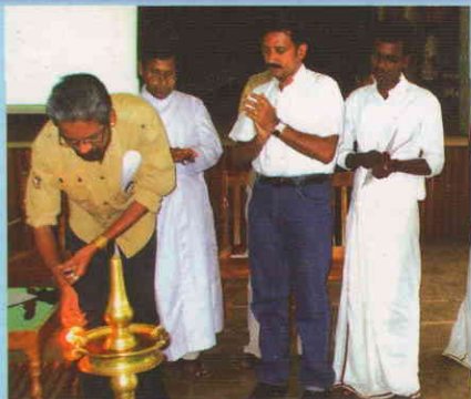
INAUGURATION OF CAMPUS FILM FESTIVAL (FILM CLUB)