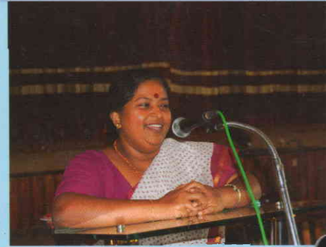
WOMEN'S CELL PROGRAMME