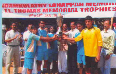
VICTORIOUS FOOTBALL TEAM