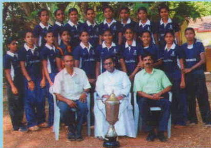
WOMEN'S FOOTBALL TEAM WITH FR. PRINCIPAL