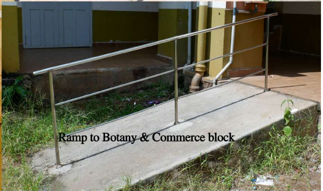
Ramp to Botany & Commerce block