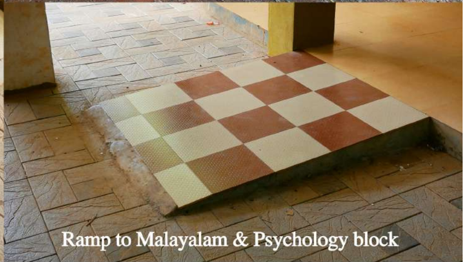
Ramp to Malayalam & Psychology block