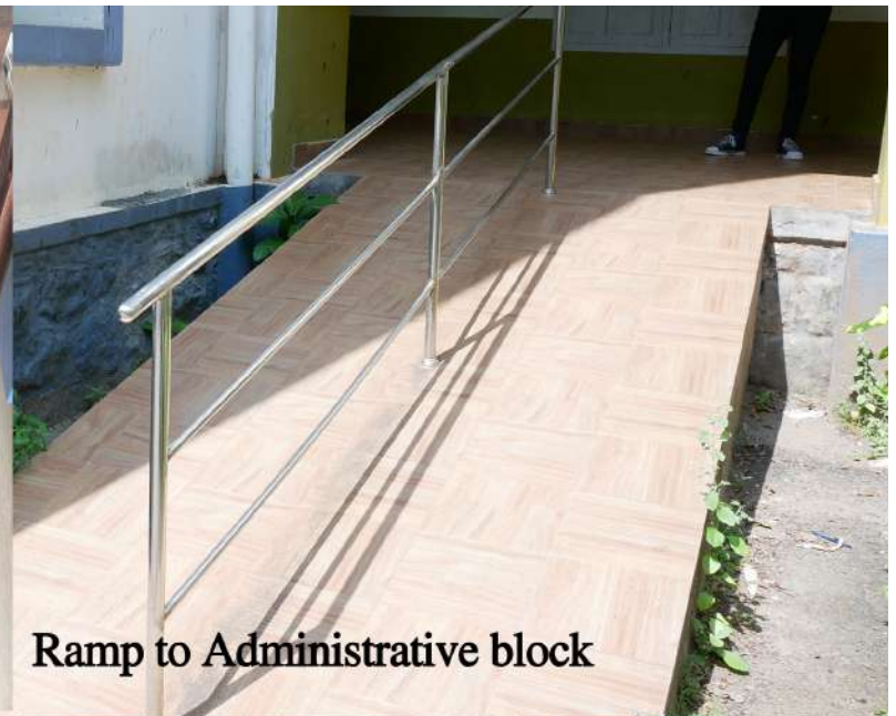
Ramp to Administrative block