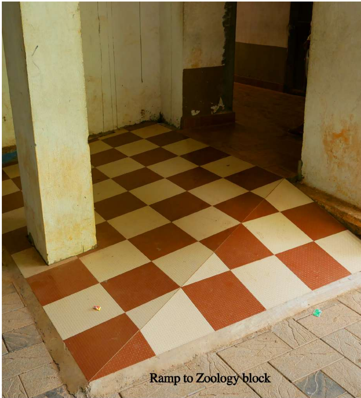
Ramp to Zoology block