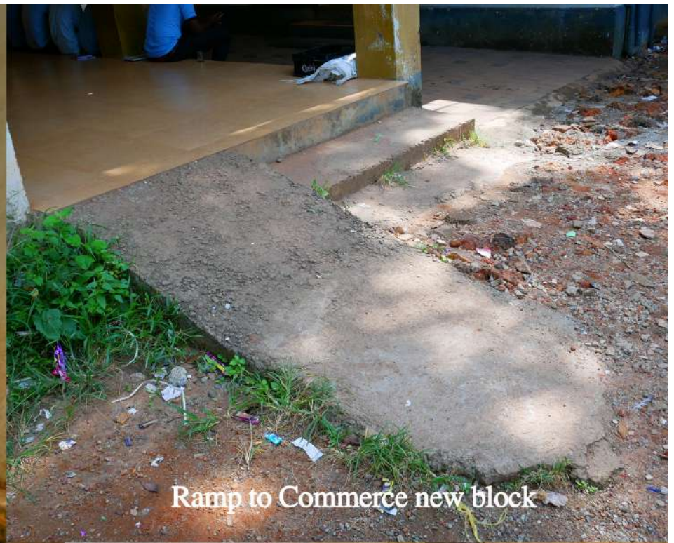
Ramp to Commerce new block