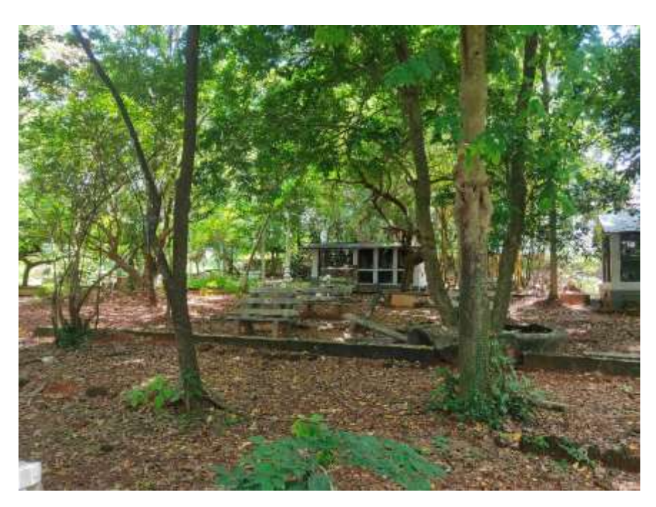
Table 8 OXYGEN PARK