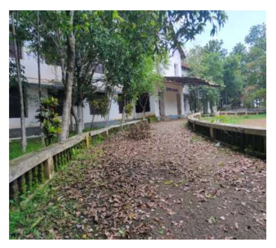
Physical education block