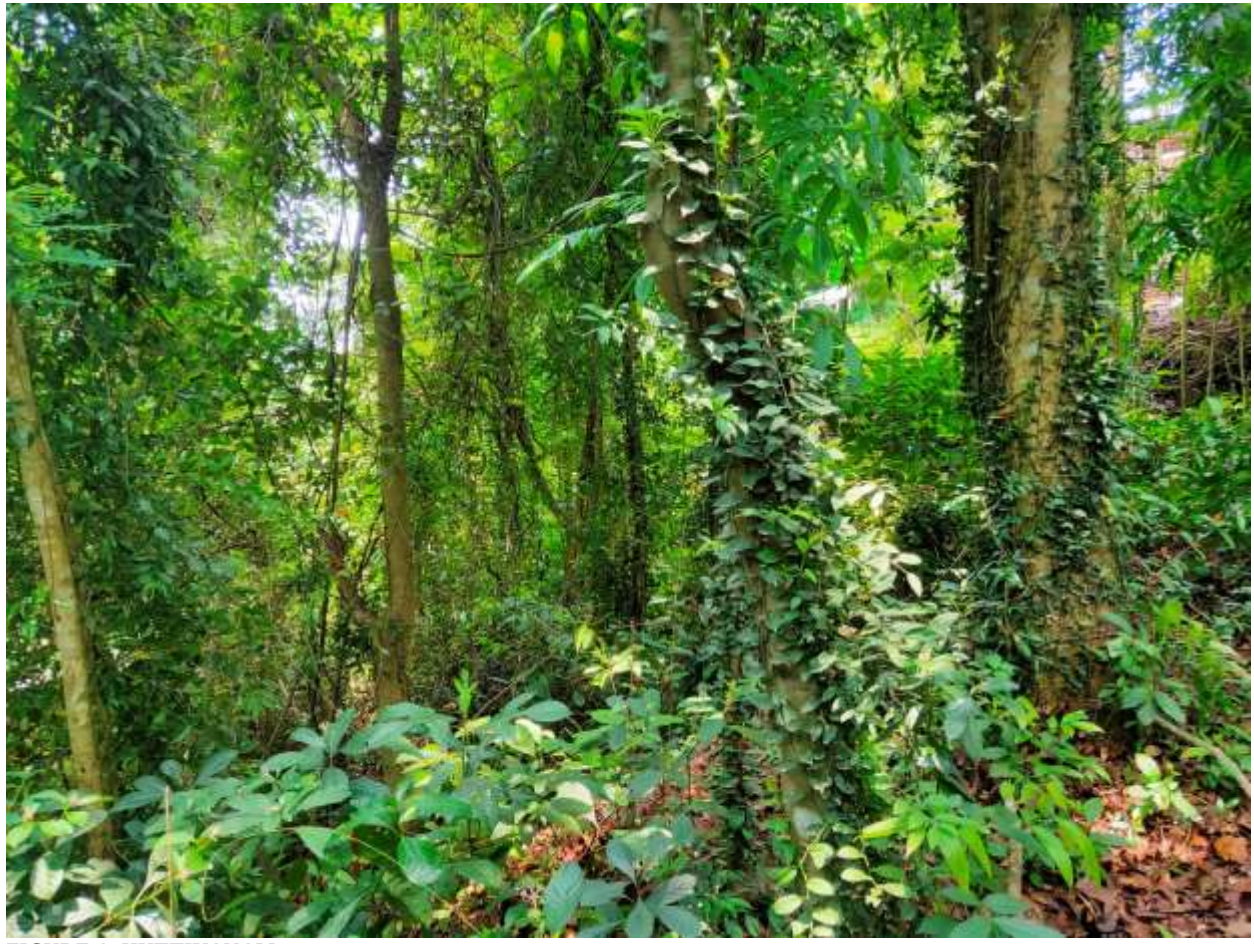
FIGURE 4: KUTTIVANAM