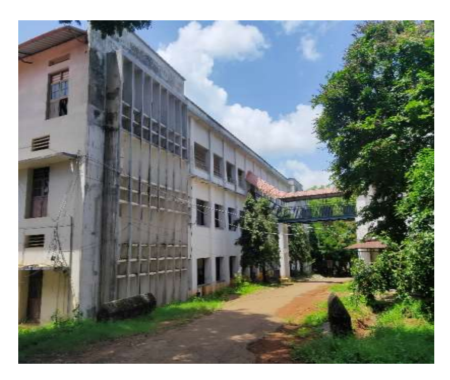
Chemistry and Geology Block