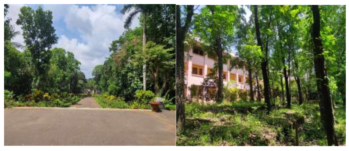
FIGURE 7: GREENERY AROUND COLLEGE