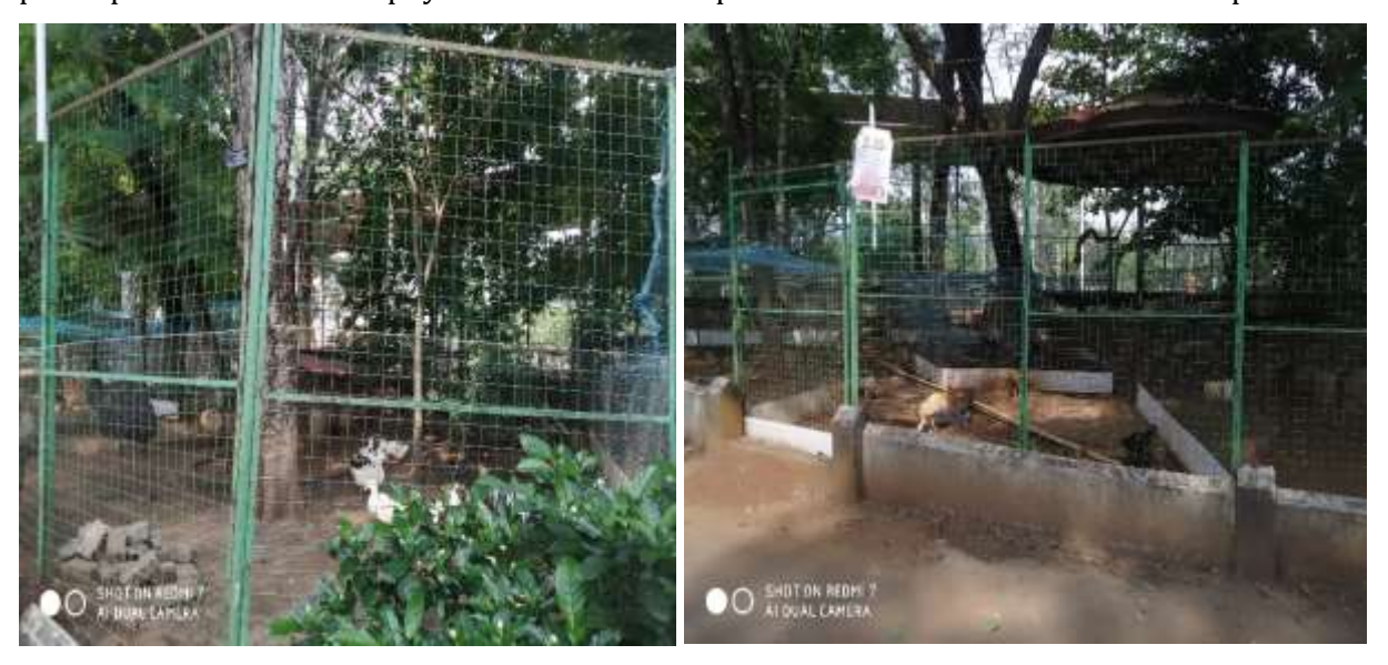
Figure 9 PETS AND BIRDS

Animals play an important role inpeople's lives. Many studies indicate that pets reduce anxiety and blood pressure. Findings suggest that the social support to a pet makes a person feel more relaxed and reduces stress. Petelp to develop great empathy, higher self-esteem, and increases participation in social and physical activities. This promotes students' emotional development.