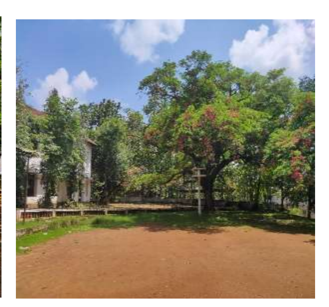
FIGURE 6 OPEN GROUNDS