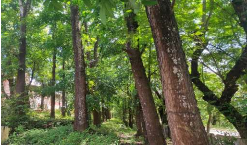
Figure 8 SILENT ZONE