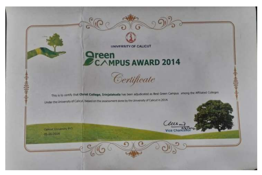
Figure 11 GREEN CAMPUS AWARD FROM UNIVERSITY OF CALICUT