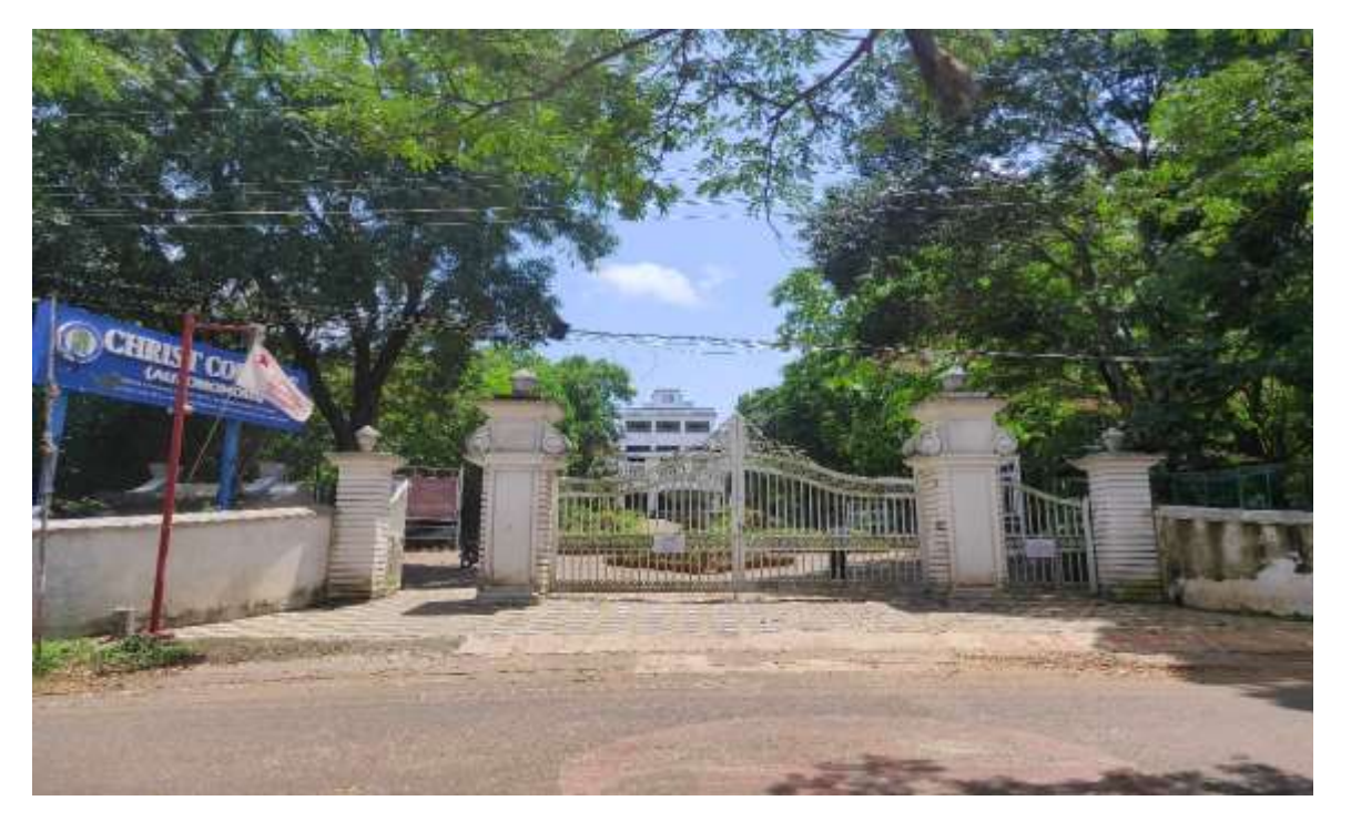
FIGURE 1: SIDE & FRONT VIEW OF THE COLLEGE