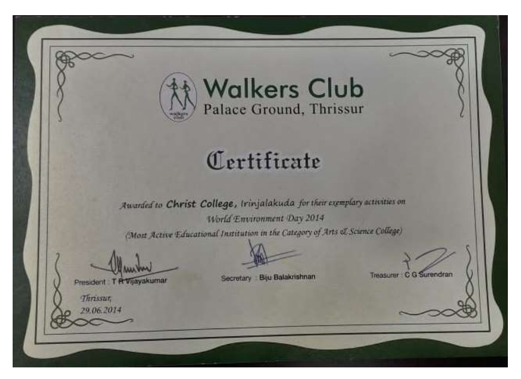
Figure 10 CERTIFICATE FROM WALKERS CLUB