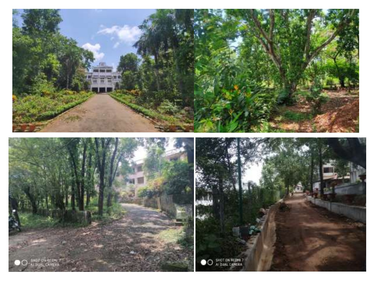
FIGURE 2: CAMPUS VIEW

Ultimately the campus is maintaining natural equilibrium with open spaces, buildings, trees, birds along with human interaction.