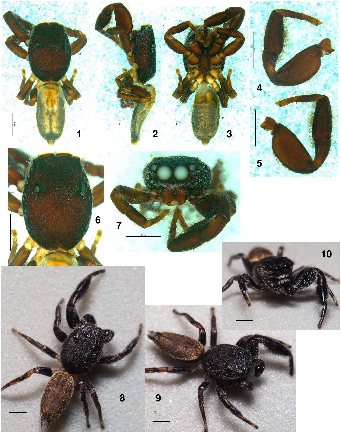
Figures 1-10. Males of Piranthus planolancis . 1-7 , Preserved male CATE 8705B from Vellangallur, Kerala. 1 , Dorsal view. 2 , Lateral view. 3 , Ventral view. 4 , First leg, prolatateral view. 5 , First leg, retrolateral view. 6 , Carapace. 7 , Face. 8-10 , Living male NCBS-BN246 from near Mysuru, Karnataka. Scale bars 1 mm.