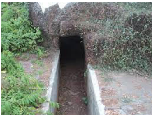
Marunnara – inside view