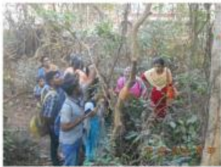
Spider documentation programme