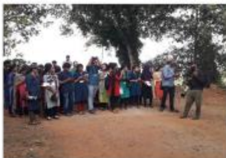
Bird documentation programme