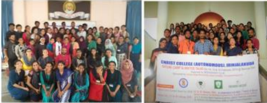
Participants of the programme