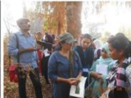
Bird Documentation programme