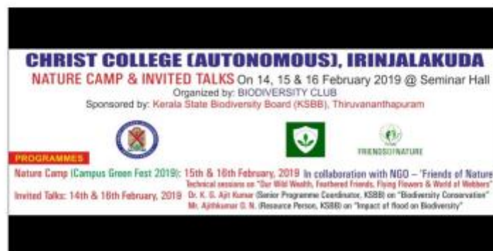
Banner of the Programme