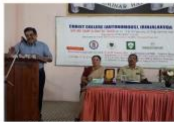
Presidential address by the Principal