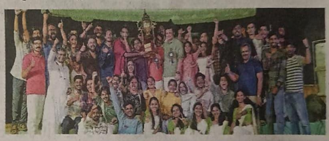
മൂന്നാം സ്ഥാനം നേടിയ ഇരിങ്ങാലക്കുട ക്രൈസ്റ്റ് കോളജ് ടീം.

ഇരിങ്ങാലക്കുട ക്രൈസ്റ്റ് കോ ളജ് 80 പോയിന്റ് നേടി മൂന്നാമ തെത്തി. കഴിഞ്ഞ ദിവസം വരെ മൂന്നാമതായിരുന്ന ആതിഥേയ രായ കാലിക്കറ്റ് സർവകലാശാല 67 പോയിന്റോടെ നാലാം സ്ഥാന