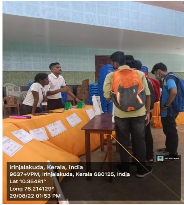
Irinjalakuda, Kerala, India 9637+VPM, Irinjalakuda, Kerala 680125, India Lat 10.35481° Long 76.214129° 29/08/22 01:53 PM