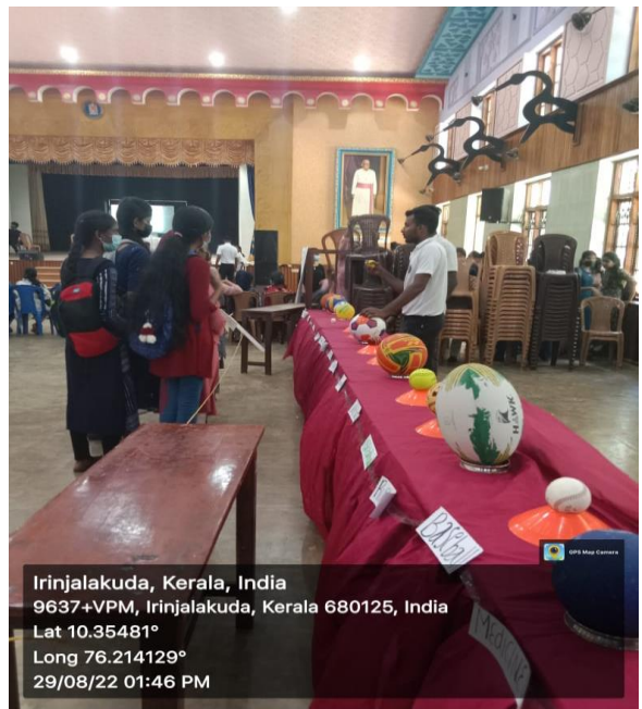
Irinjalakuda, Kerala, India 9637+VPM, Irinjalakuda, Kerala 680125, India Lat 10.35481° Long 76.214129° 29/08/22 01:46 PM