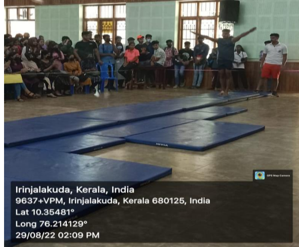
Irinjalakuda, Kerala, India 9637+VPM, Irinjalakuda, Kerala 680125, India Lat 10.35481° Long 76.214129° 29/08/22 02:09 PM