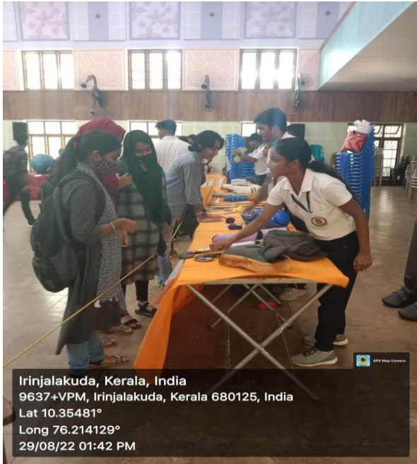
Irinjalakuda, Kerala, India 9637+VPM, Irinjalakuda, Kerala 680125, India Lat 10.35481° Long 76.214129° 29/08/22 01:42 PM