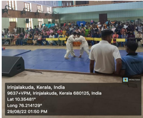
Irinjalakuda, Kerala, India 9637+VPM, Irinjalakuda, Kerala 680125, India Lat 10.35481° Long 76.214129° 29/08/22 01:50 PM