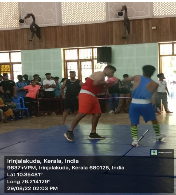
Irinjalakuda, Kerala, India 9637+VPM, Irinjalakuda, Kerala 680125, India Lat 10.35481° Long 76.214129° 29/08/22 02:03 PM