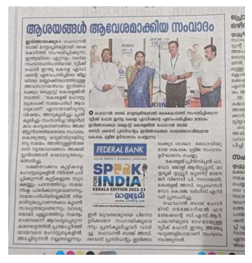
Paper Cutting of Speak India Debate Competition