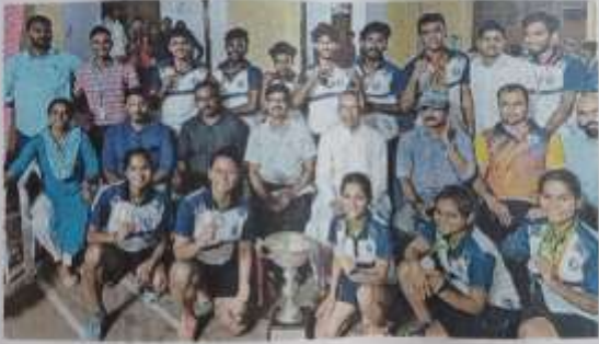
കോളേജ് ടീമിന്റെ അംഗങ്ങൾ ഇടതുവശത്ത്. കോളേജിന്റെ അംഗങ്ങൾ വലതുവശത്ത്.

ഇന്ത്യയിലെ ഏറ്റവും മികച്ച കോളേജ് ടീമുകളിലൊന്നായി ക്രൈസ്റ്റ് കോളേജിനെ തിരഞ്ഞെടുത്തു. കോളേജിന്റെ ടീം കോഴിക്കോട് ഗവ. ഫിസിക്കൽ എജ്യൂക്കേഷൻ കോളേജിൽ എത്തിച്ചേർന്നു. ടീം അതിവിശിഷ്ടമായി പ്രകടനം കാഴ്ചവെച്ചു. ടീം അതിവിശിഷ്ടമായി പ്രകടനം കാഴ്ചവെച്ചു. ടീം അതിവിശിഷ്ടമായി പ്രകടനം കാഴ്ചവെച്ചു.