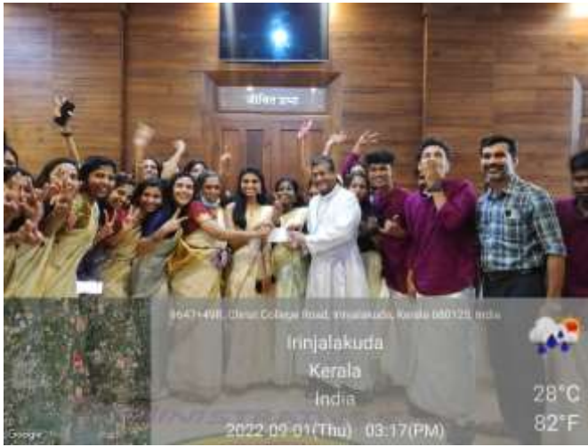
First Prize Department of Chemistry