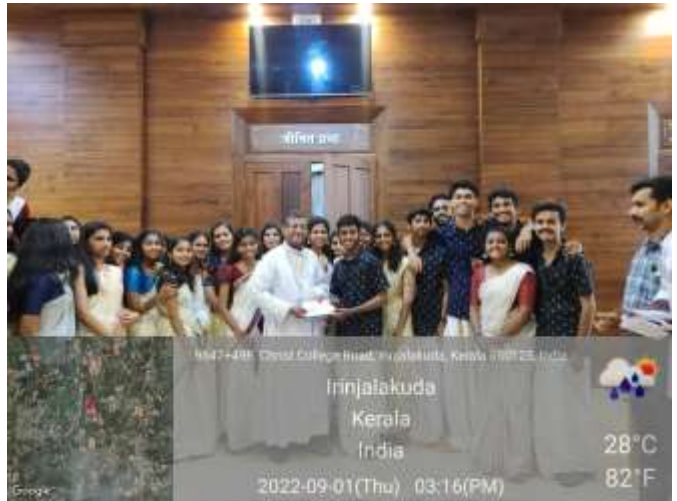
Third Prize Department of Psychology