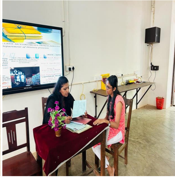
Personal interactions with students