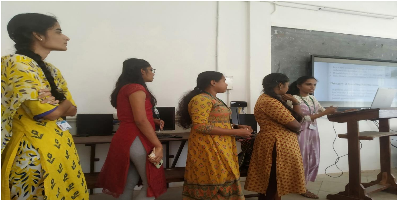
CLASS ROOM DISCUSSIONS