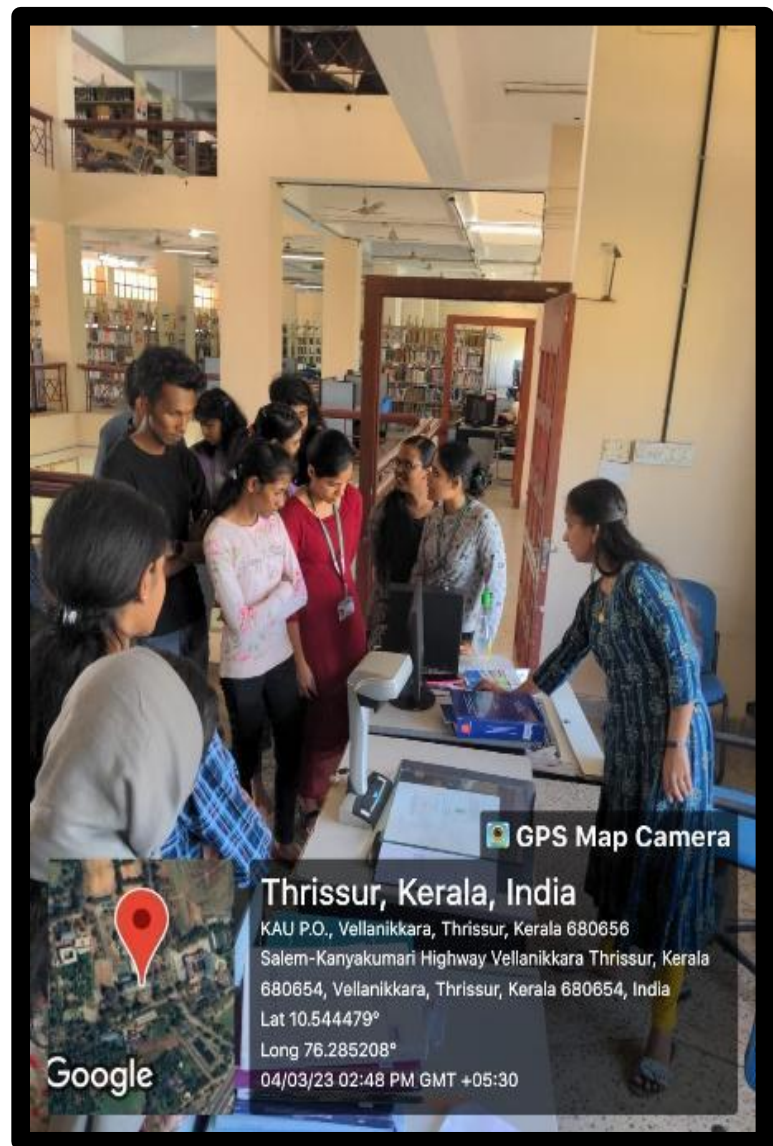
Kerala Agricultural University, Vellanikkara, Thrissur With the Librarian and other staff