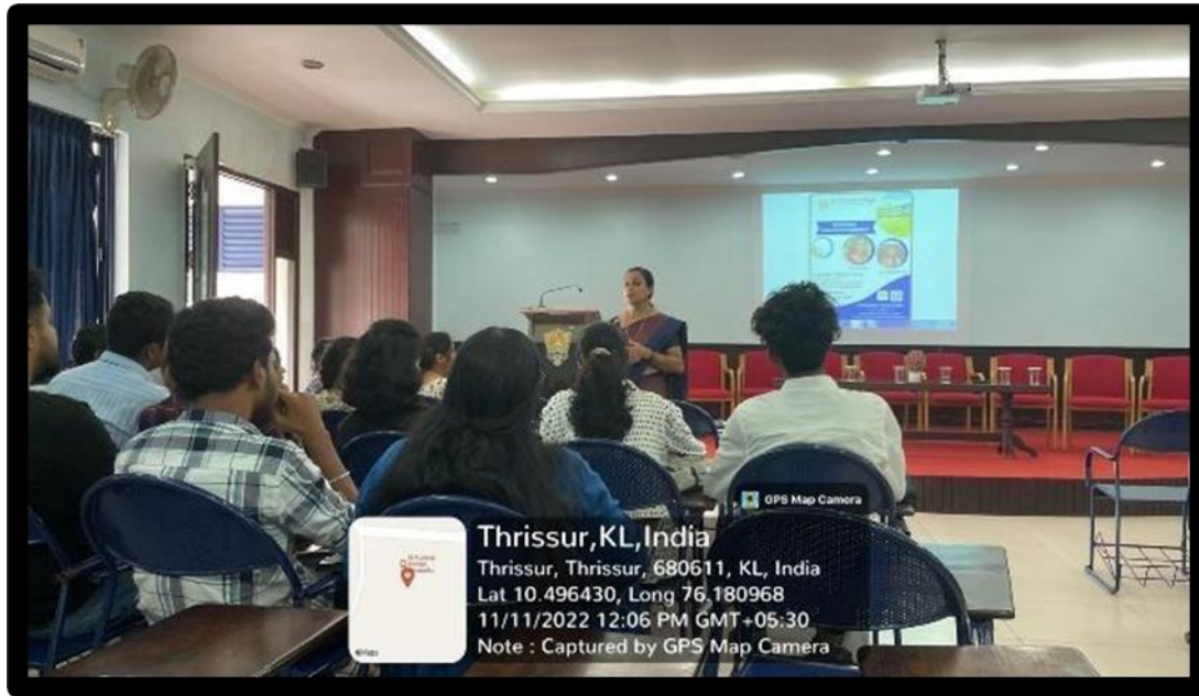
Presentation for our students By Librarian, St. Aloysius College Library, Elthuruth, Thrissur