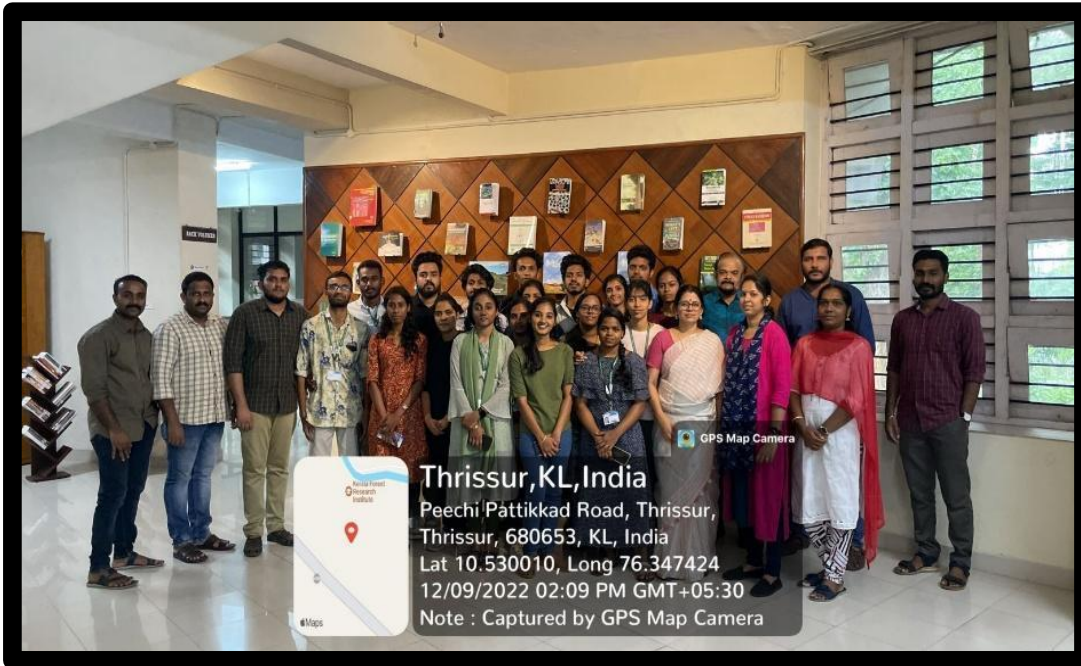
Kerala Forest Research Institute, Peechi, Thrissur With Librarian and staff