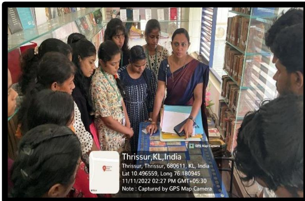
St. Aloysius College Library, Elthuruth, Thrissur