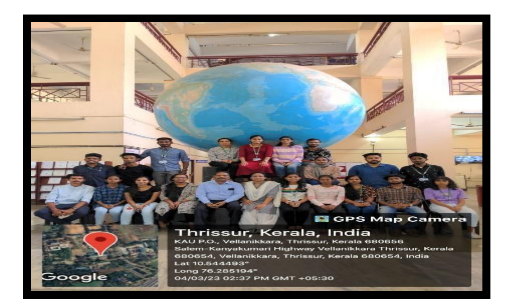
University Library, Kerala Agricultural University, Thrissur

Each group was sent to nearby libraries for observation and study for participatory and experimental learning. As B.Lib.I.Sc is a professional programme it is very important to understand a real situation beyond the classroom. Each student has to visit a minimum of six different library types and submit a record of work and seminar presentation.