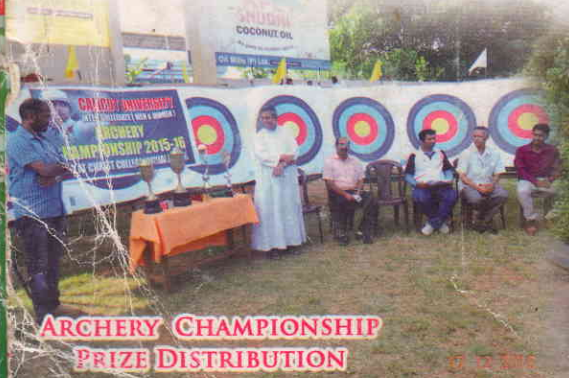
ARCHERY CHAMPIONSHIP PRIZE DISTRIBUTION