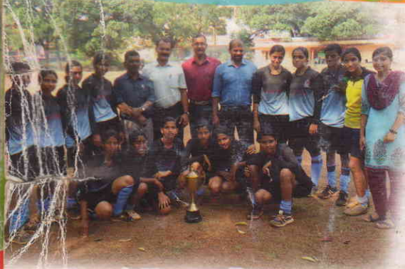
WOMEN'S HOCKEY TEAM

Keeping up the glorious tradition in sports and games Christ College won the S.B College football tournament. Christ college bagged the first place in the Calicut University Athletic Championship. Our women athletes won third place in the championship. Our men's Gymnastics team won first place in the university level championship. We were first in athletics, table tennis and archery (Indian round) and came second in Hockey, tennis, and badminton. Christ College also hosted Calicut University Archery Championship, University athletic camp, CBSE Thrissur Sahodaya meet etc. Many of our students have been selected to state and national teams.