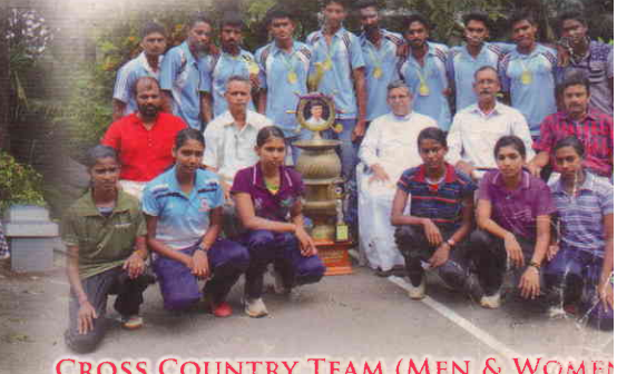
CROSS COUNTRY TEAM (MEN & WOMEN)

Editor : Dr.K.J.Varghese (Dept.of English)