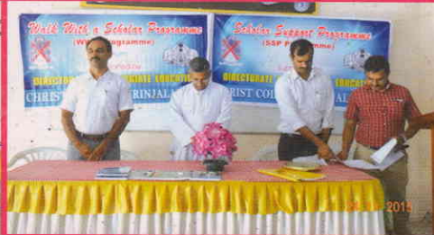
Inauguration of Walk With Scholar Programme and Scholar Support Programme, Govt. of Kerala