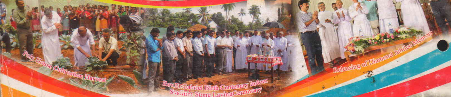
Poly House Cultivation Harvest