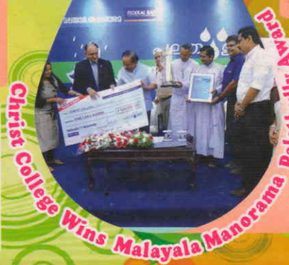
Christ College Wins Malayala Manorama Palathully Award

III rd BA Functional English bagged First Prize in Interclass Competitions which adjudge academic literary, cultural and sports talents among the students. Various competitions were conducted at the interclass level and the prizes obtained by the students from intercollegiate competitions were also considered for the best class of the college. 3 rd BA Functional English batch came first with 143 points and III rd B.Com aided batch came second