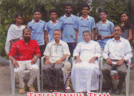
TABLE TENNIS TEAM