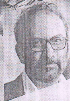
Prof. Pulickel M. Ajayan