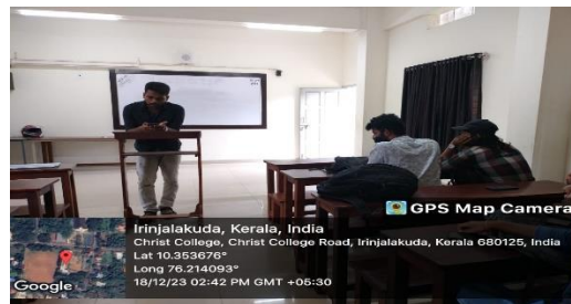
Student reciting the self-composed poem.