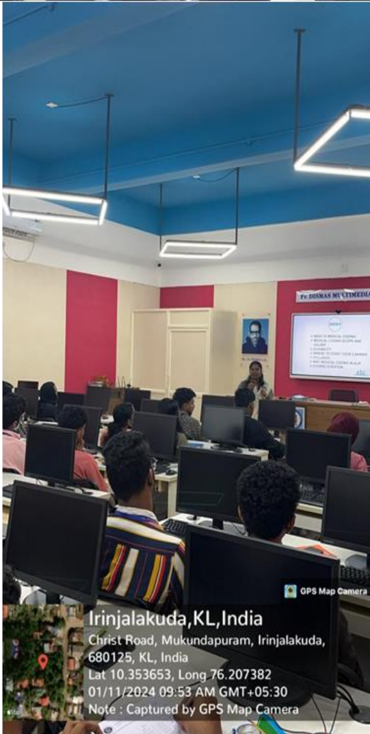
Irinjalakuda, KL, India Christ Road, Mukundapuram, Irinjalakuda, 680125, KL, India Lat 10.353653, Long 76.207382 01/11/2024 09:53 AM GMT+05:30 Note : Captured by GPS Map Camera