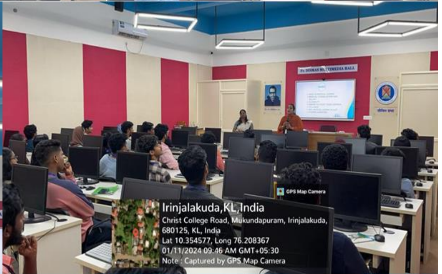
Irinjalakuda, KL, India Christ College Road, Mukundapuram, Irinjalakuda, 680125, KL, India Lat 10.354577, Long 76.208367 01/11/2024 09:46 AM GMT+05:30 Note : Captured by GPS Map Camera