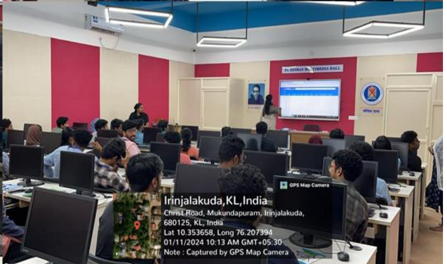
Irinjalakuda, KL, India Christ Road, Mukundapuram, Irinjalakuda, 680125, KL, India Lat 10.353658, Long 76.207394 01/11/2024 10:13 AM GMT+05:30 Note : Captured by GPS Map Camera