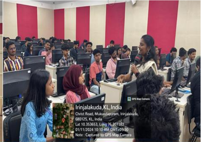
Irinjalakuda, KL, India Christ Road, Mukundapuram, Irinjalakuda, 680125, KL, India Lat 10.353653, Long 76.207382 01/11/2024 10:10 AM GMT+05:30 Note : Captured by GPS Map Camera