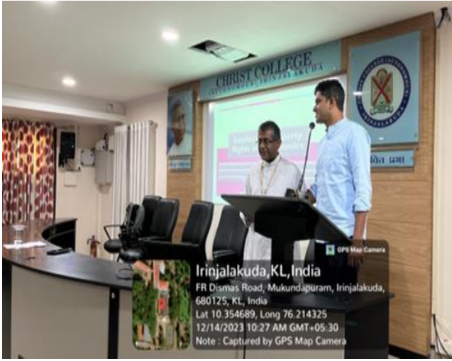
Irinjalakuda, KL, India FR Dismas Road, Mukundapuram, Irinjalakuda, 680125, KL, India Lat 10.354689, Long 76.214325 12/14/2023 10:27 AM GMT+05:30