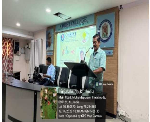
Irinjalakuda, KL, India Main Road, Mukundapuram, Irinjalakuda, 680121, KL, India Lat 10.350570, Long 76.214589 12/14/2023 10:18 AM GMT+05:30 Note : Captured by GPS Map Camera