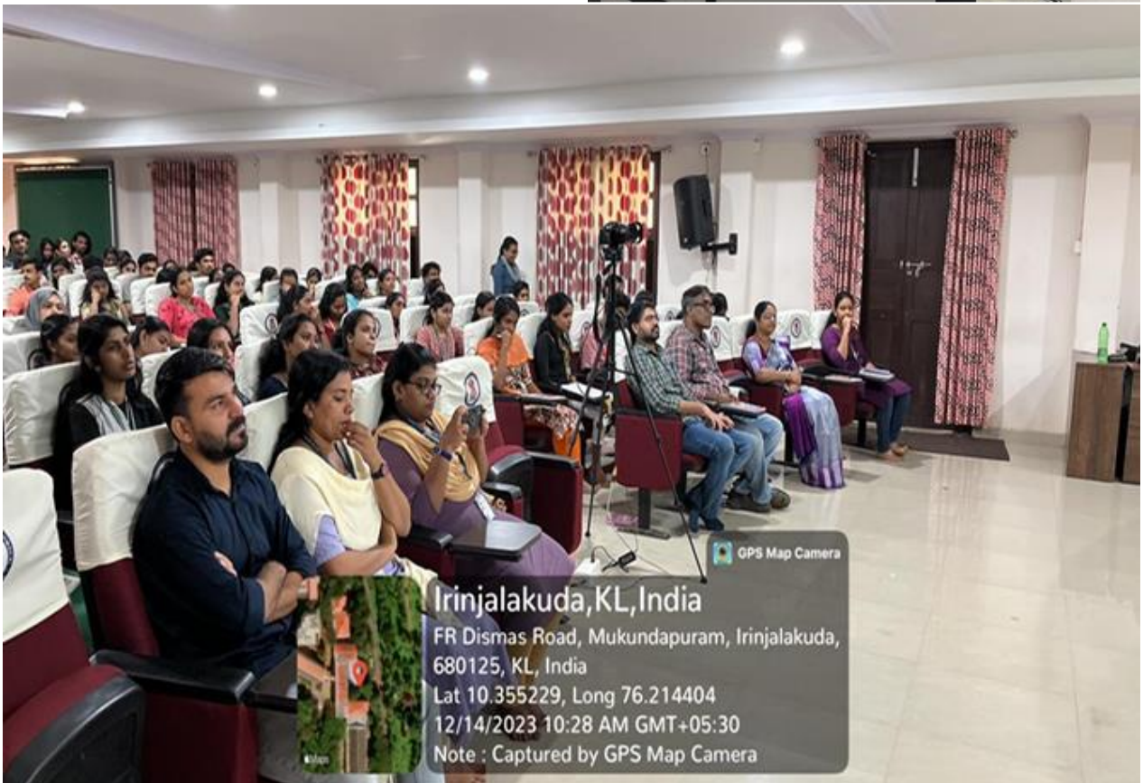
Irinjalakuda, KL, India FR Dismas Road, Mukundapuram, Irinjalakuda, 680125, KL, India Lat 10.355229, Long 76.214404 12/14/2023 10:28 AM GMT+05:30 Note : Captured by GPS Map Camera