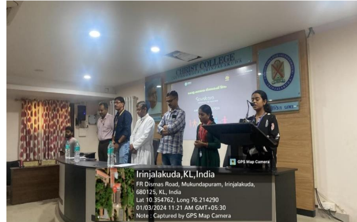
Irinjalakuda, KL, India FR Dismas Road, Mukundapuram, Irinjalakuda, 680125, KL, India Lat 10.354762, Long 76.214290 01/03/2024 11:21 AM GMT+05:30 Note : Captured by GPS Map Camera