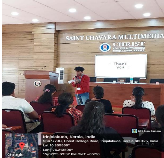
Irinjalakuda, Kerala, India 9647+79G, Christ College Road, Irinjalakuda, Kerala 680125, India Lat 10.355559° Long 76.213506° 15/07/23 03:32 PM GMT +05:30