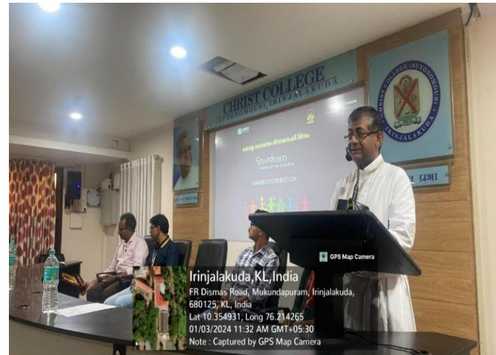
Irinjalakuda, KL, India FR Dismas Road, Mukundapuram, Irinjalakuda, 680125, KL, India Lat 10.354931, Long 76.214265 01/03/2024 11:32 AM GMT+05:30 Note : Captured by GPS Map Camera