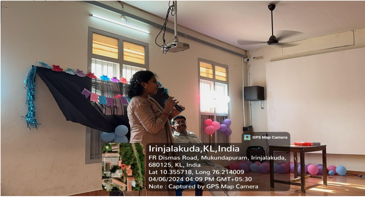
Irinjalakuda, KL, India FR Dismas Road, Mukundapuram, Irinjālakuda, 680125, KL, India Lat 10.355718, Long 76.214009 04/06/2024 04:09 PM GMT+05:30 Note : Captured by GPS Map Camera