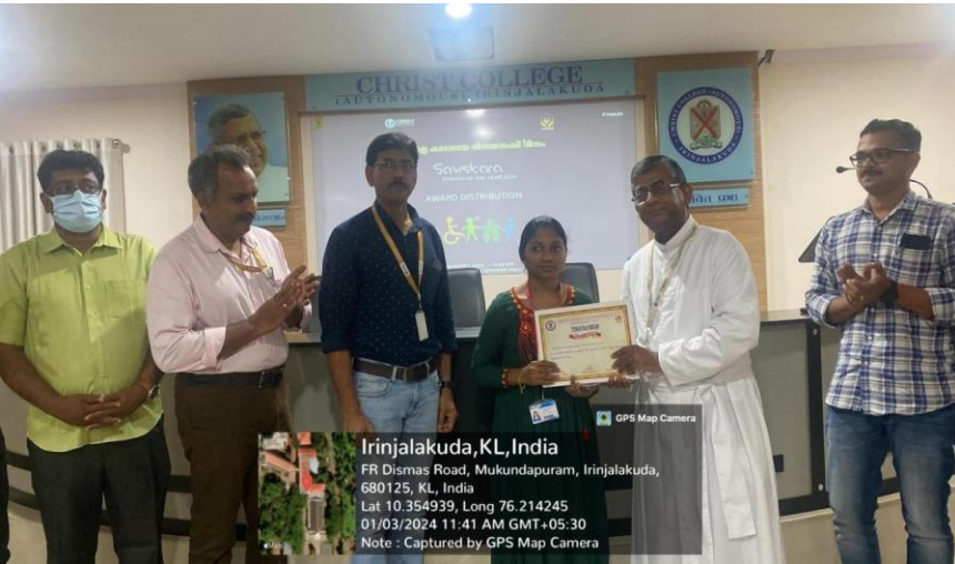
Irinjalakuda, KL, India FR Dismas Road, Mukundapuram, Irinjalakuda, 680125, KL, India Lat 10.354939, Long 76.214245 01/03/2024 11:41 AM GMT+05:30 Note : Captured by GPS Map Camera