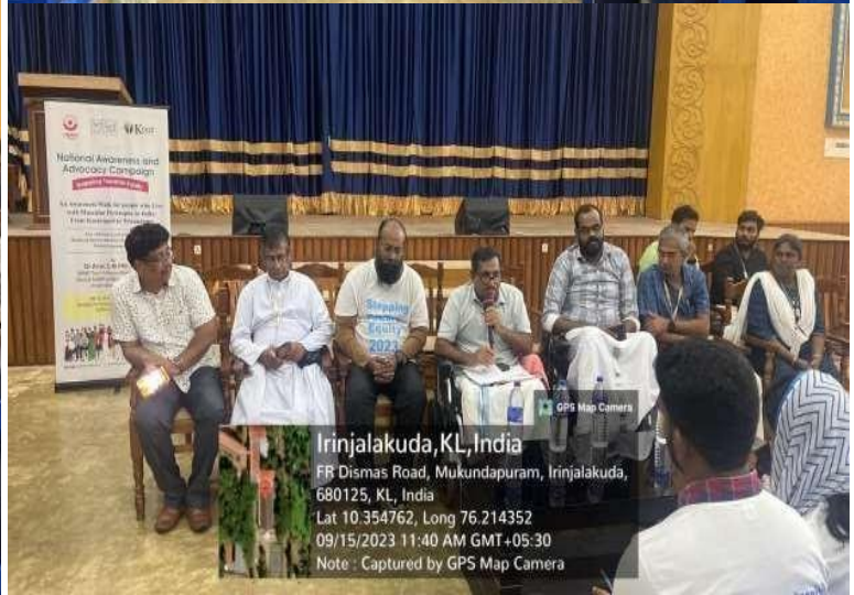
Irinjalakuda, KL, India FR Dismas Road, Mukundapuram, Irinjalakuda, 680125, KL, India Lat 10.354762, Long 76.214352 09/15/2023 11:40 AM GMT+05:30 Note : Captured by GPS Map Camera