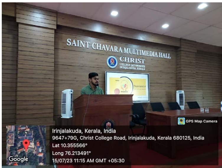
Irinjalakuda, Kerala, India 9647+79G, Christ College Road, Irinjalakuda, Kerala 680125, India Lat 10.355566° Long 76.213491° 15/07/23 11:15 AM GMT +05:30