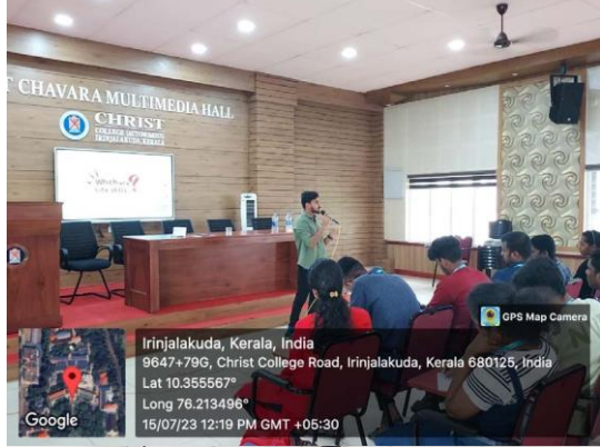
Irinjalakuda, Kerala, India 9647+79G, Christ College Road, Irinjalakuda, Kerala 680125, India Lat 10.355567° Long 76.213496° 15/07/23 12:19 PM GMT +05:30