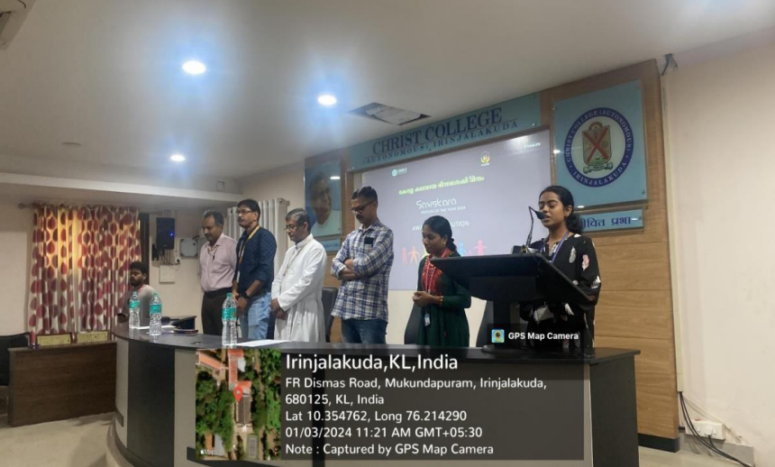
Irinjalakuda, KL, India FR Dismas Road, Mukundapuram, Irinjalakuda, 680125, KL, India Lat 10.354762, Long 76.214290 01/03/2024 11:21 AM GMT+05:30 Note : Captured by GPS Map Camera