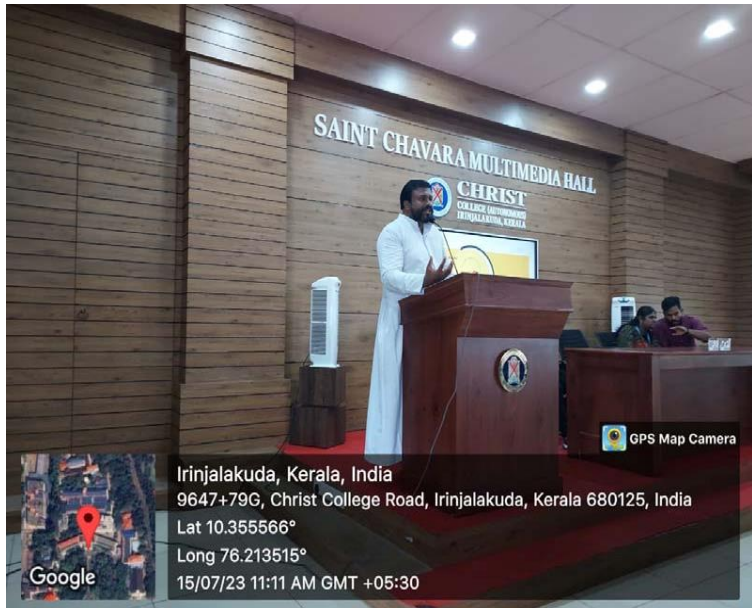
Irinjalakuda, Kerala, India 9647+79G, Christ College Road, Irinjalakuda, Kerala 680125, India Lat 10.355566° Long 76.213515° 15/07/23 11:11 AM GMT +05:30