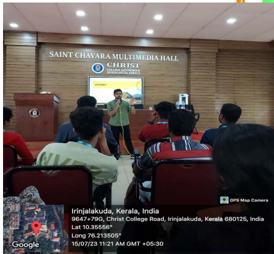
Irinjalakuda, Kerala, India 9647+79G, Christ College Road, Irinjalakuda, Kerala 680125, India Lat 10.35556° Long 76.213505° 15/07/23 11:21 AM GMT +05:30