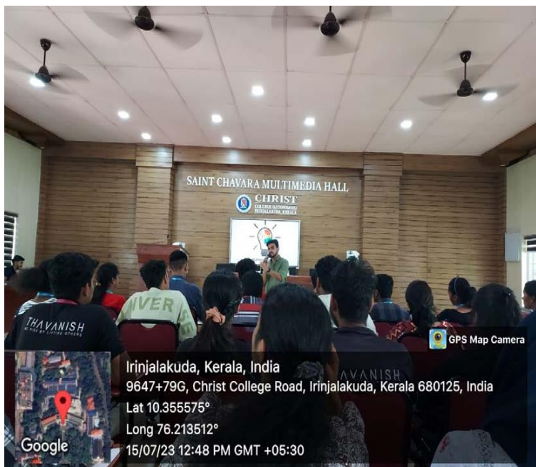
Irinjalakuda, Kerala, India 9647+79G, Christ College Road, Irinjalakuda, Kerala 680125, India Lat 10.355575° Long 76.213512° 15/07/23 12:48 PM GMT +05:30