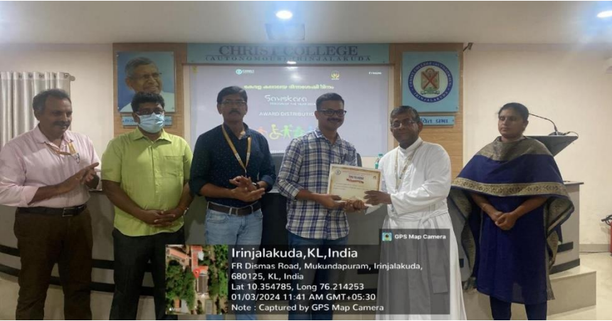
Irinjalakuda, KL, India FR Dismas Road, Mukundapuram, Irinjalakuda, 680125, KL, India Lat 10.354785, Long 76.214253 01/03/2024 11:41 AM GMT+05:30 Note : Captured by GPS Map Camera