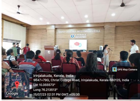
Irinjalakuda, Kerala, India 9647+79G, Christ College Road, Irinjalakuda, Kerala 680125, India Lat 10.355573° Long 76.213513° 15/07/23 02:31 PM GMT +05:30