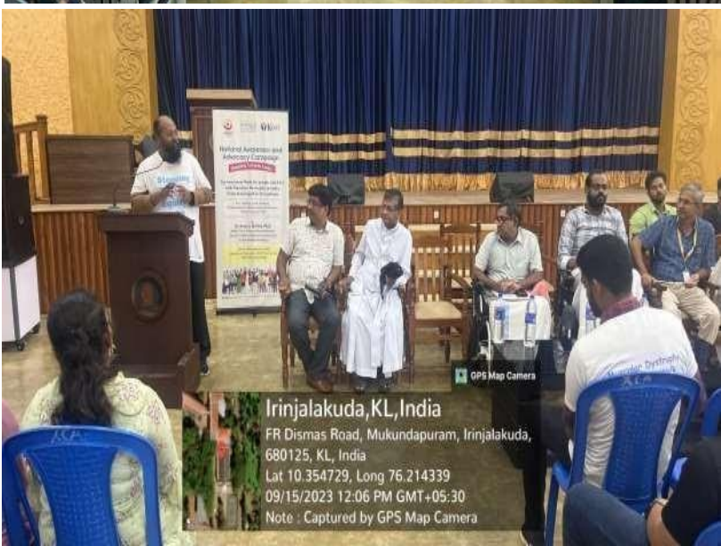
Irinjalakuda, KL, India FR Dismas Road, Mukundapuram, Irinjalakuda, 680125, KL, India Lat 10.354729, Long 76.214339 09/15/2023 12:06 PM GMT+05:30 Note : Captured by GPS Map Camera