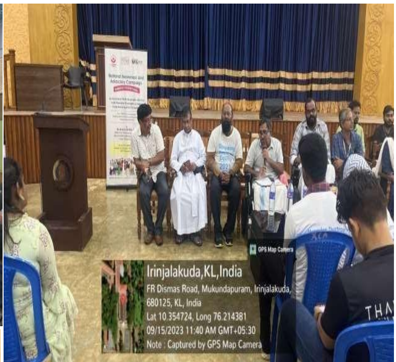
Irinjalakuda, KL, India FR Dismas Road, Mukundapuram, Irinjalakuda, 680125, KL, India Lat 10.354724, Long 76.214381 09/15/2023 11:40 AM GMT+05:30 Note : Captured by GPS Map Camera