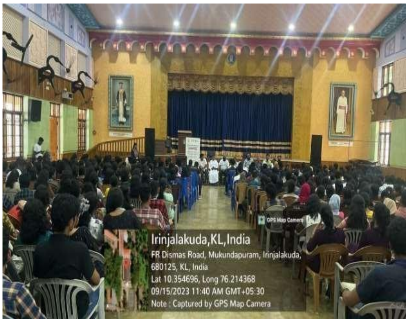
Irinjalakuda, KL, India FR Dismas Road, Mukundapuram, Irinjalakuda, 680125, KL, India Lat 10.354696, Long 76.214368 09/15/2023 11:40 AM GMT+05:30 Note : Captured by GPS Map Camera