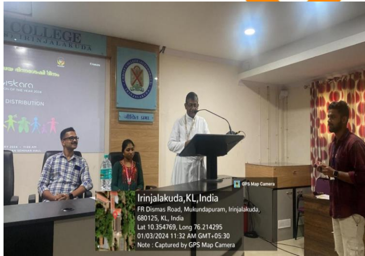
Irinjalakuda, KL, India FR Dismas Road, Mukundapuram, Irinjalakuda, 680125, KL, India Lat 10.354769, Long 76.214295 01/03/2024 11:32 AM GMT+05:30 Note : Captured by GPS Map Camera