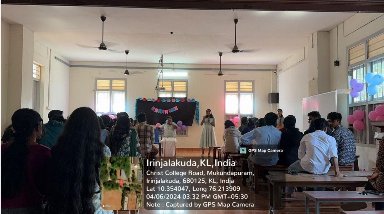
Irinjalakuda, KL, India Christ College Road, Mukundapuram, Irinjalakuda, 680125, KL, India Lat 10.354047, Long 76.213909 04/06/2024 03:32 PM GMT+05:30

ous) the ous ish oled vity, uda, um, ipal ned vere and and