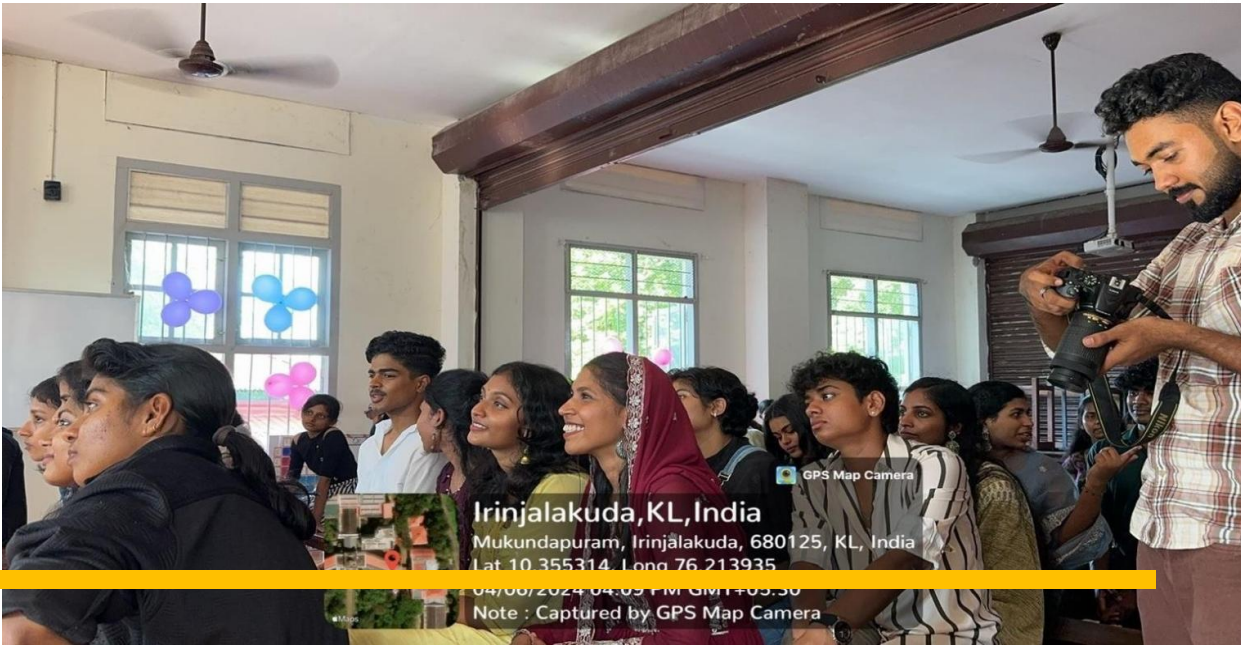
Irinjalakuda, KL, India Mukundapuram, Irinjālakuda, 680125, KL, India Lat 10.355314, Long 76.213935 04/06/2024 04:09 PM GMT+05:30 Note : Captured by GPS Map Camera