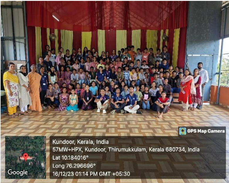
Kundoor, Kerala, India 57MW+HPX, Kundoor, Thirumukkulam, Kerala 680734, India Lat 10.184016° Long 76.296696° 16/12/23 01:14 PM GMT +05:30