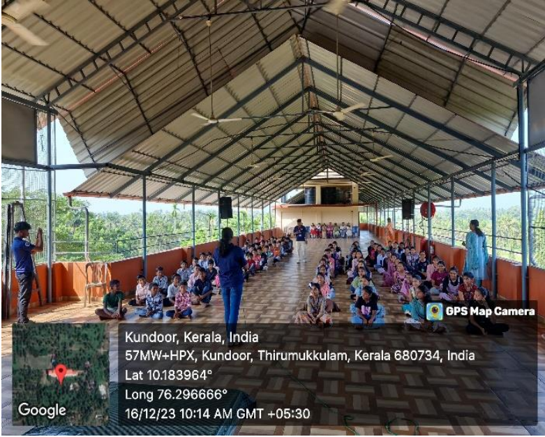
Kundoor, Kerala, India 57MW+HPX, Kundoor, Thirumukkulam, Kerala 680734, India Lat 10.183964° Long 76.296666° 16/12/23 10:14 AM GMT +05:30