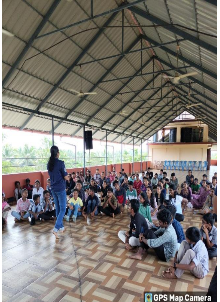
Kundoor, Kerala, India 57MW+HPX, Kundoor, Thirumukkulam, Kerala 680734, India Lat 10.184074° Long 76.296712° 16/12/23 12:51 PM GMT +05:30