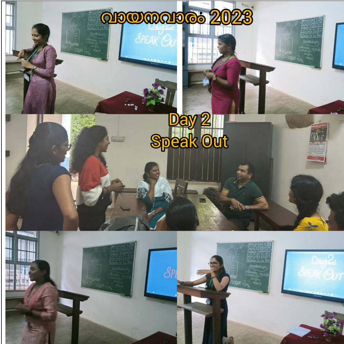
GENERAL DEBATES AND DISCUSSIONS