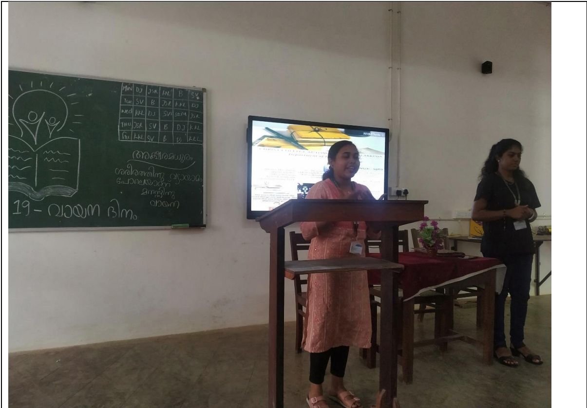
OBSERVATION OF SPECIAL DAYS