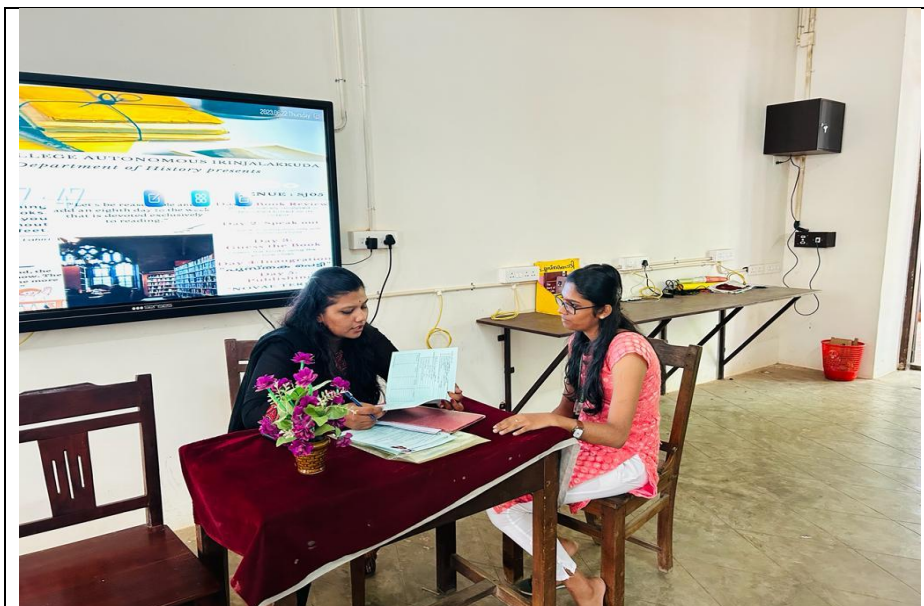
PERSONAL INTERACTIONS WITH STUDENTS