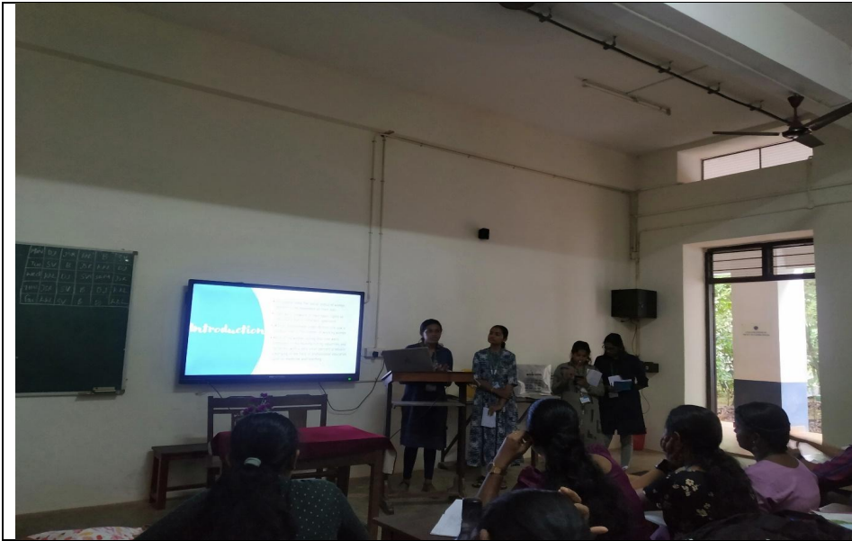
Group activities- Group presentations

Assignments were given to review books, articles and documentaries. News report making and its discussions in the class. Preparation of Class magazines. Field visits and study tour Participation in seminars and conferences by students