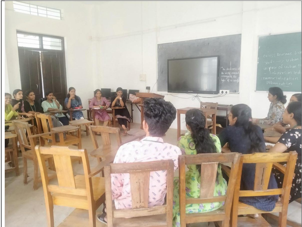
OPEN DISCUSSIONS ON SOCIAL ISSUES