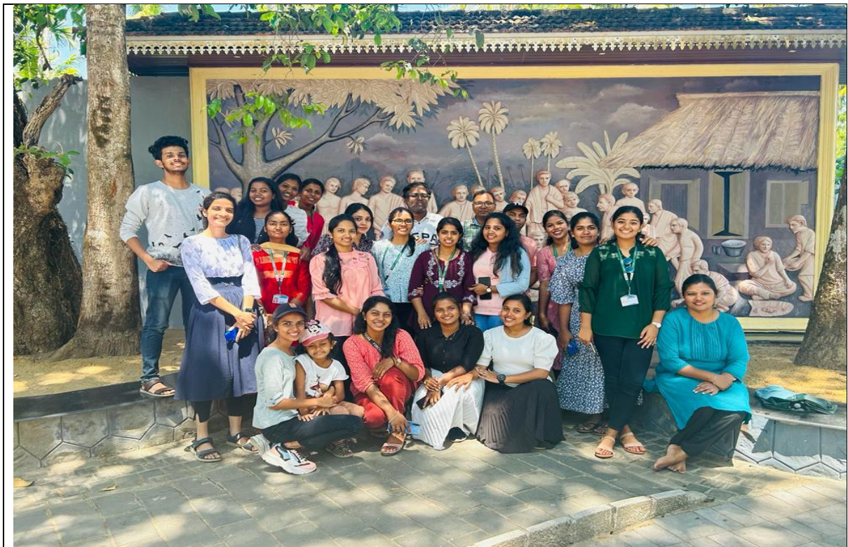
FIELD VISITS TO HISTORICAL PLACES