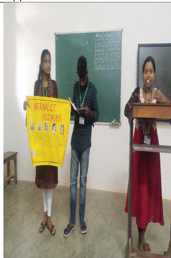
NEWS PAPER REPORT PRESENTATION BASED ON SYLLABUS – GROUP ACTIVITY