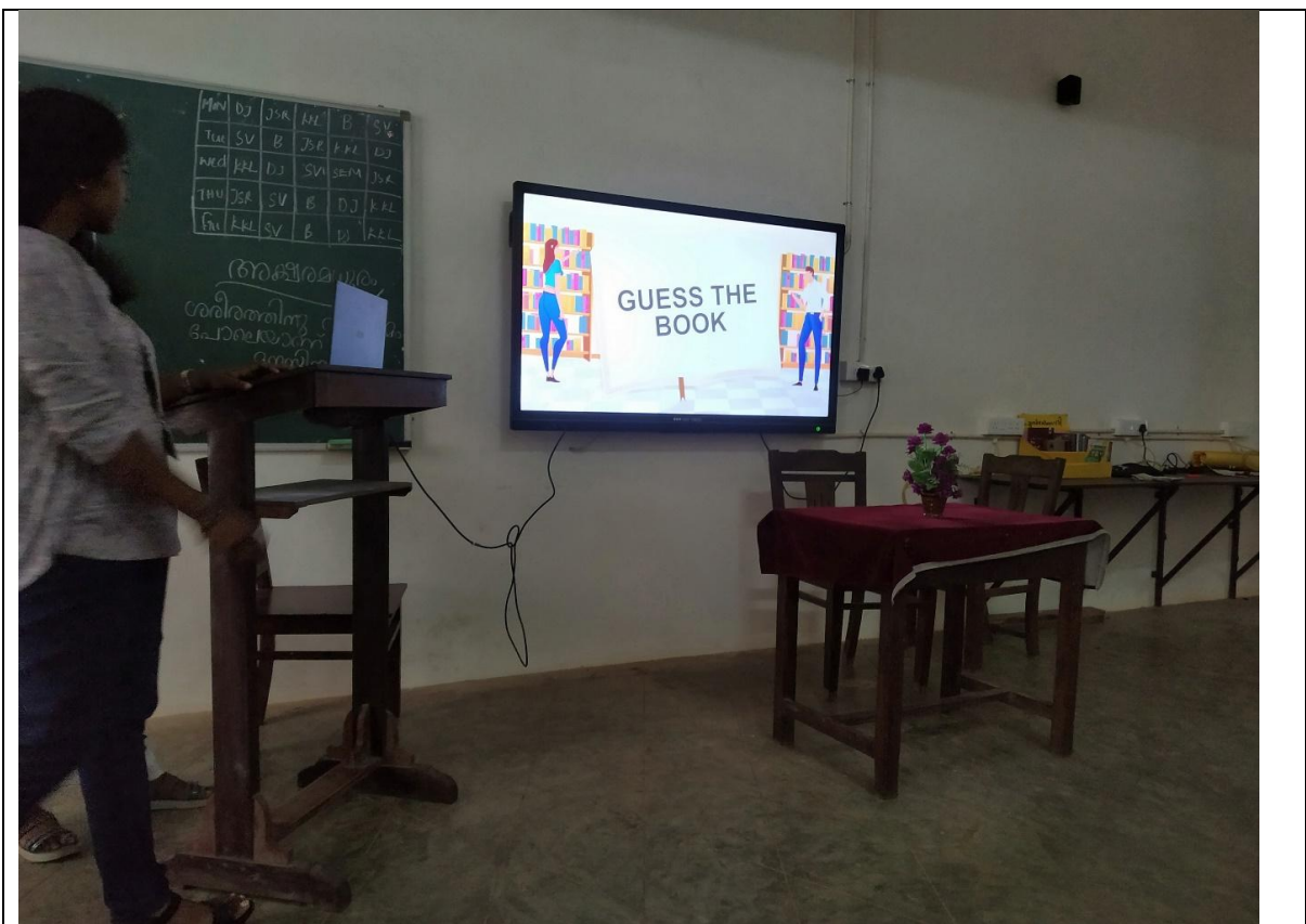
CONDUCTING THE QUIZES